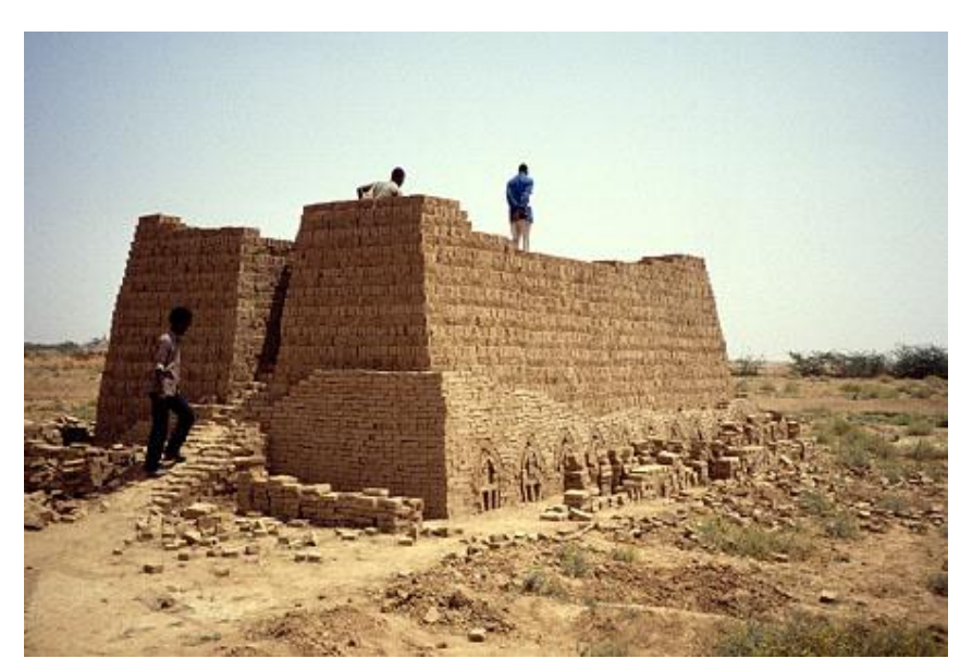
Figure 1: Large clamp kiln near Kassala, Sudan.

must fuse together when fired. When bricks are fired in a kiln or clamp a ceramic bond should be formed. Depending on the type of clay, this happens at temperatures between 900 and 1,200°C. The bond gives bricks strength and resistance to erosion by water. The temperature at which bricks are fired is critical. If it's too low, the bond is poor, resulting in a weak product. If