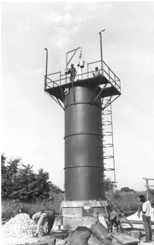
Figure 1: The improved kiln design.

Traditionally lime has been produced at Chenkumbi in large open box kilns (See Malawi lime case study No 1). The techniques employed, however, were unable to meet the demand for chemical grade lime required by the sugar processing industry, which had to import lime at considerable cost.