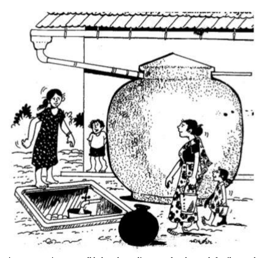
Figure 1: The Pumpkin water tank

The Abikon family of Demetaralhina in Badulla District chose a pumpkin tank. Their village is in a rural highlands area of the country and the ground conditions were not suitable for a groundwater supply or for digging a pit for a below ground tank. Average annual rainfall is 2250mm with a bimodal rainfall pattern (two wet seasons) and the longest dry period usually between December and April.