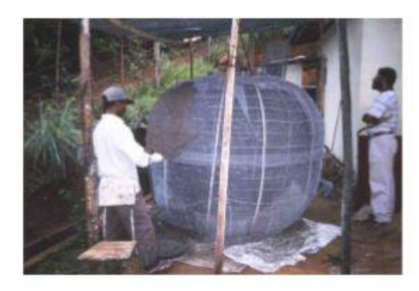
Figure 2: a) One of the 10 legs used to form the skeleton frame. b) The skeleton frame being rendered.