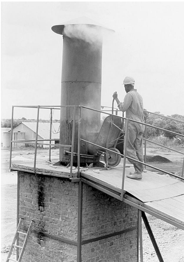
Figure 1: Loading stone/fuel through the hopper at the chimney level, lime kiln, Chegutu, Zimbabwe Photo: Practical Action / Kelvin Mason.

If simple, field methods are to be used, it is easier to test the quality of 'lime' when it is in the form of quicklime, i.e. calcium oxide \text{CaO} . This would be the case if the lime were being bought direct from a kiln before the kiln operator had started to hydrate it. Usually, though, as quicklime will deteriorate if left exposed to the air and because it can be a hazardous material to handle, lime is more usually available and purchased as hydrated or 'slaked' lime, i.e. calcium hydroxide \text{Ca(OH)}_2 .