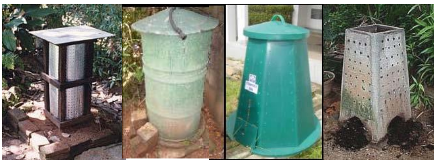
Plate: Different composting bin designs available in Sri Lanka.

Bin composting is the most popular and advance version of home composting system that overcomes problems experienced in other composting systems. There are different types of bins available for home composting and generally it varies from 200- 300L in size. These are from different materials such as cement/concrete, plastic, metal, etc. The bins allow higher stacking of composting materials and better use of floor space than free-standing piles. Bins can also eliminate weather problems and reduce problems of odours, and provide better temperature control. At present, most bins are designed to suit the urban landscape as well.