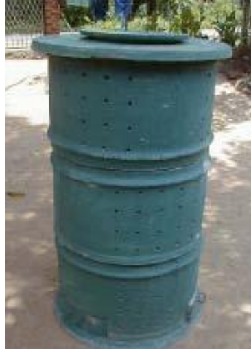
Concrete bin widely used in Sri Lanka