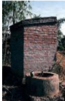
Figure 1: Household Biolatrone showing toilet attached to a bio-digester

The biogas generated can be used for cooking, lighting, refrigeration, heating and electricity production purposes or even as a substitute to petrol and diesel in engines.