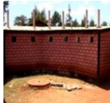
Figure 2: Large-scale biolatrone system showing the Biogas and toilet structures.

How does the system work? Many different types of the bio-latrines components exist but all are built to minimise the risk of gas leakage. This is most likely to occur on corners and joints; therefore a cylindrical or half-sphere shape tends to be favoured. The three most common designs of plant are fixed dome, floating drum and flexible bag digesters which are often further adapted to suit local situations and requirements. See the Technical Brief Biogas for an introduction to biogas technologies.