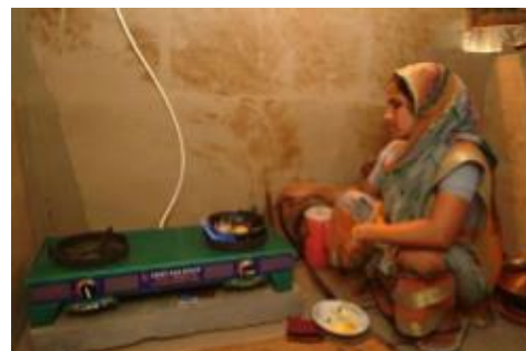
Figure 3: Woman cooking with biogas

How does the system work? Many different types of the bio-latrines components exist but all are built to minimise the risk of gas leakage. This is most likely to occur on corners and joints; therefore a cylindrical or half-sphere shape tends to be favoured. The three most common designs of plant are fixed dome, floating drum and flexible bag digesters which are often further adapted to suit local situations and requirements. See the Technical Brief Biogas for an introduction to biogas technologies.