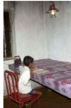
Figure 4: Young boy doing his homework using light from a biogas lamp.

Particular care should also be taken to prevent non-biological materials other than human waste and toilet paper entering the system, otherwise bl