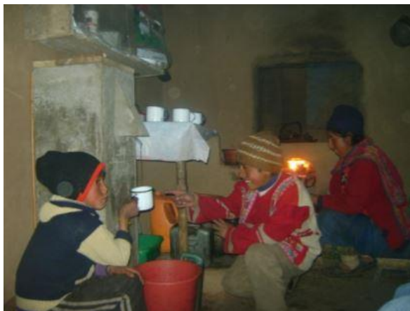
Figure 5: Bio-sand filters are easy to use.

Bio-sand filters require daily fillings during the 2 to 3 weeks when the biological layer is growing. Bio-sand filters also require regular cleaning, which involves agitating the water above the biological layer. The filter will require 1 to 2 weeks of non-use after agitation to allow for the regrowth of the biological layer. On occasion, the sand in the filter needs to be cleaned as well. There are several different methods to clean the sand, though all of them require significant labour, significant training, or high cost. User error has also been found to affect the filter's efficacy, especially because of the required 2 to 3 week nonuse period for growing the biological layer. The users of the filter must have a maintenance guide (for example, a plasticized leaf). This guide can be adhered to the filter or it is possible to be placed on the wall near the filter.