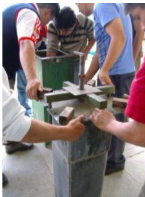
Figure 4: Removal of the concrete filter from the metal mould.

The body is often constructed from concrete using a metal mould. Construction guidelines are available from http://www.cawst.org and http://www.biosandfilter.org/ . However, other designs use oil drums or plastic containers and these do not require a mould. The use of a mould makes it difficult to mass produce the filters as they are made on site on an individual basis.