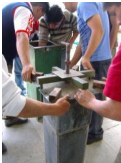
Figure 4: Removal of the concrete filter from the metal mould.

The body is often constructed from concrete using a metal mould. Construction guidelines are available from http://www.cawst.org and http://www.biosandfilter.org/ . However, other designs use oil drums or plastic containers and these do not require a mould. The use of a mould makes it difficult to mass produce the filters as they are made on site on an individual basis.