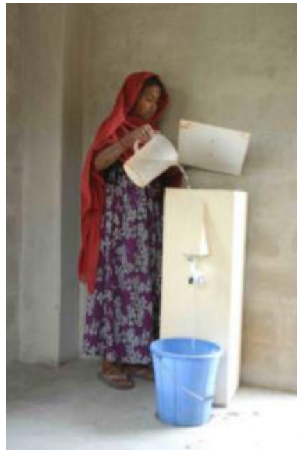
Figure 1: Domestic bio-sand filter used in Bangladesh.

The difference in a traditional slow sand filter and the newer bio-sand filter is that the drain is piped back up to between 1 and 8 cm above the sand level allowing a shallow layer of water to sit on top of the sand, where the biofilm (schmutzdecke) is created. This ensures that the sand within the system is always covered by water even when no water is added to the system. Experimental evidence shows that oxygen will still reach the organisms in the sand.