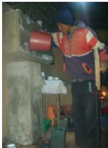
Figure 2: A domestic bio-sand water filter being used in Peru.