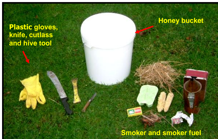
Plastic gloves, knife, cutlass and hive tool