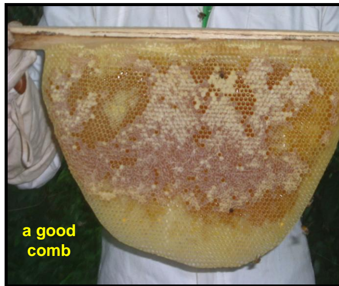
a good comb