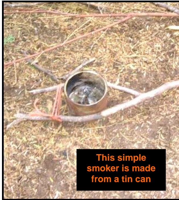
This simple smoker is made from a tin can