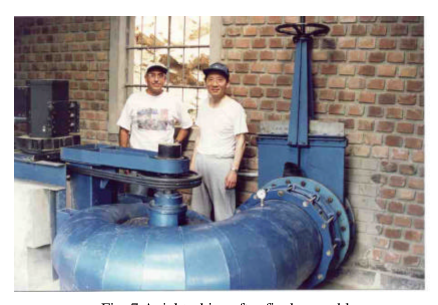
Fig. 7 Axial turbine after final assembly

The equipment is started after all necessary adjustments are done,. (Fig. 7)