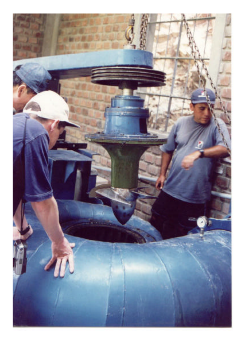
Fig. 6 Joining of the shaft and components to the frame.