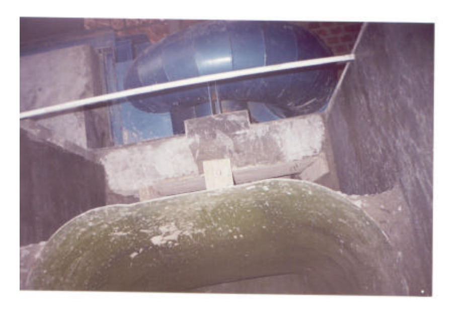
Fir. 3 Suction Tube coupled to the Axial Turbine frame

Coupled to the suction tube, a rectangular discharge channel constructed to direct the turbine-discharged water in the house of machines towards the river (Fig.4 and 5).