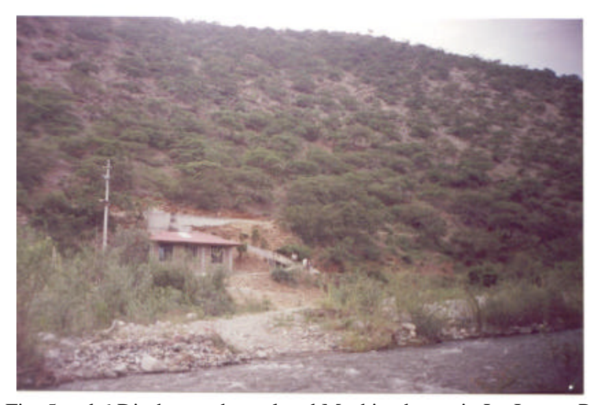
Fig. 5 and 6 Discharge channel and Machine house in La Juntas, Peru