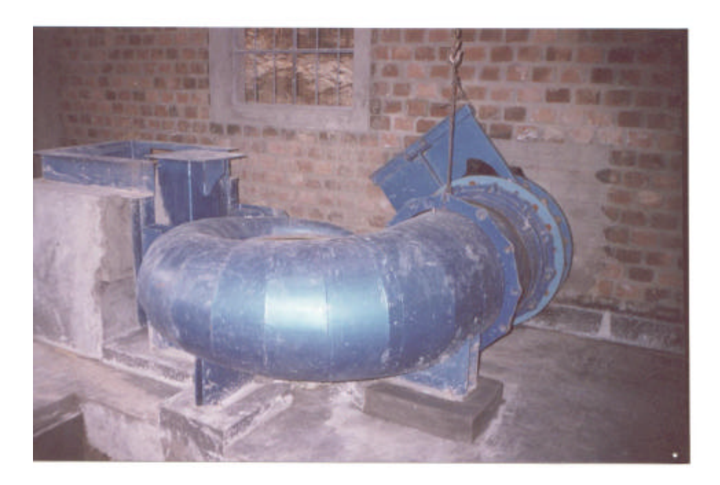
Fig. 1 and 2 Leveling and Anchoring of the Axial Turbine Frame.

The installed turbine frame is the guide for the flange of the suction tube coupling to the flange of the cover of the runner (area of rotation) in the inferior face of the frame, between the flanges, a 3 mm, minimum thickness, rubber reinforced gasket is used. Fig. 3 shows the suction tube coupled to the turbine frame