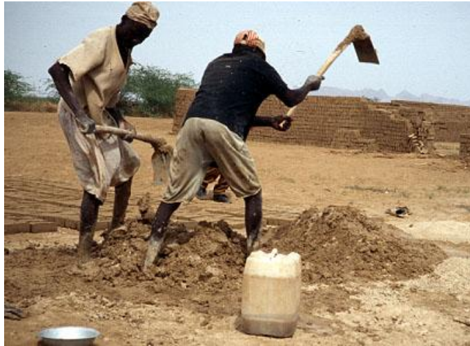
Figure 1: Preparation and mixing of cow-dung bricks.

Sudan is the largest country in Africa. Half of its 30 million inhabitants live on about 15% of the land (1) . Vegetation ranges from equatorial forest in the south to desert in the north, and semi-arid plain in the rest of the country. This plain is bounded by mountains and high plateaus on the countries western, southern and northeast boundaries. Tropical continental climate extends over most of the Sudan. Average rainfall is less than 25 mm in the north and increases to 1500 mm in the southern mountains. Temperatures range from 17°C in January to 47°C in April and May.