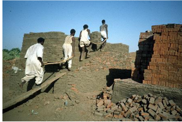
Figure 3: Staking of bricks for clamp-firing.

and enough water was added to give a workable plasticity. Each sample set consisted of 50 bricks, half of them slop-moulded in a double metal mould, and the other half sand-moulded in a single compartment wooden mould. Both moulds have the same dimensions (23 x 11 x 7 cm). All samples were sun-dried (8) for three weeks, and fired in a clamp kiln for four consecutive days (9) . Capacity of the kiln was completed to 14000 (10) bricks by loading 20 - 30% "normal" bricks together with the samples. After firing, 4 individual bricks from each sample set were packed and sent for testing strength, water absorption and density. Green and fired dimensions were also determined. Table (3) shows the experimental results for the slop and sandmoulded samples with the same dung content.