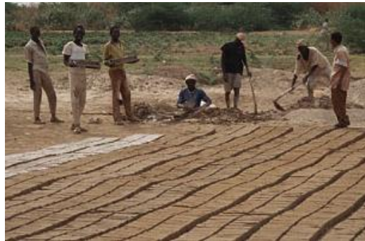
Figure 2: Slop-moulding and drying of bricks.

Cow-dung improves the plasticity of clays and acts as reinforcing agent reducing concentrated cracks that can lead to breakage within the raw bricks. Upon firing the dung fibres ignite, thus assisting in even firing of bricks and minimizing the development of high temperature gradients within the brick - a phenomenon which may lead to firing cracks. When the fibres burn out they leave cavities within the brick which reduce unit weight and improve thermal characteristics. Cavities on top and bottom surfaces of the bricks increase the bond when bricks are laid in a mortar bed.