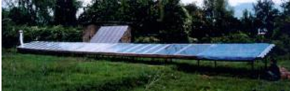
Modified Tunnel Type Solar Dryer at RECAST