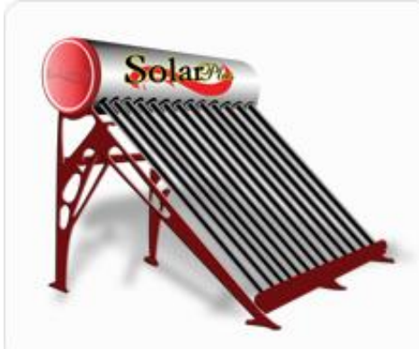
Detail diagram of Solar-pro heating system.