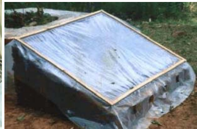
Mud Solar Dryer Nepal

These are very simple designs and the size can vary. Further details are not available.