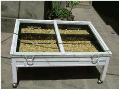
Ginger Drying in Solar Dryer