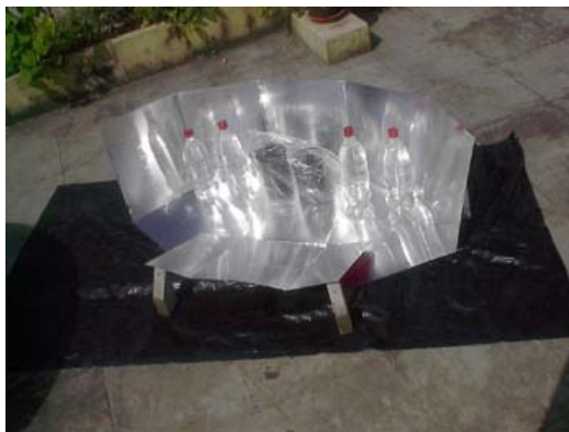
3-Plated Solar Panel Cooker Pasteurizes one Liter water in 01 hr.