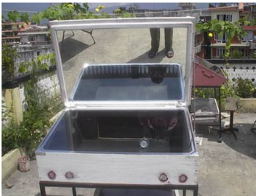
Solar Box Cooker