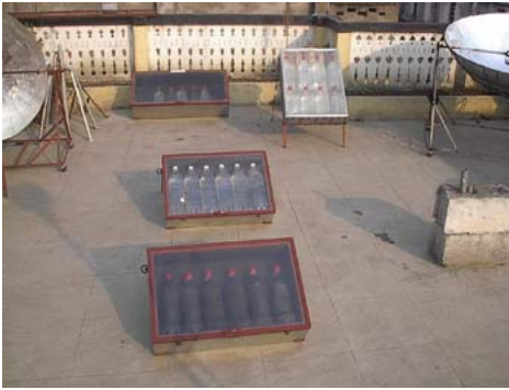
Solar Water Disinfectors Disinfects 9-12 liters water.