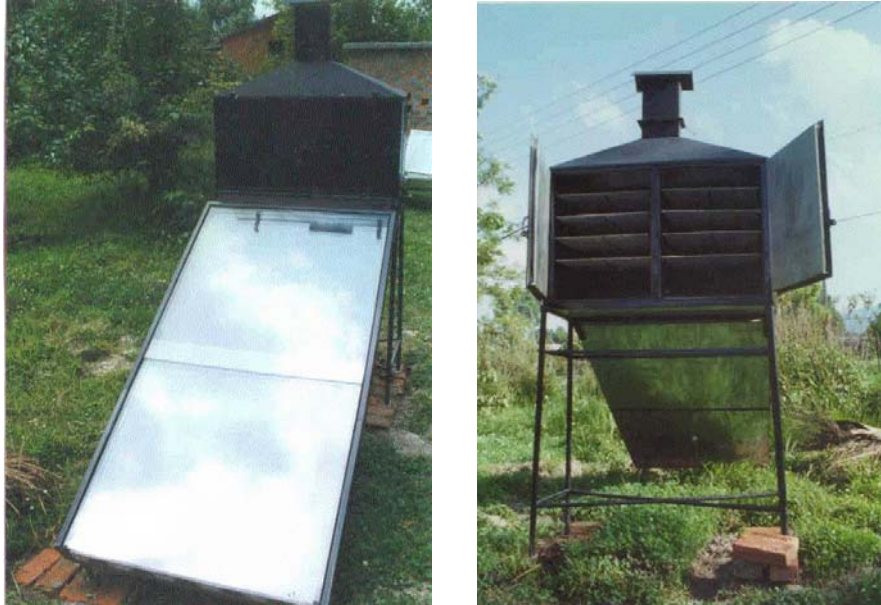
Modified Rack Type Solar Dryer at RECAST