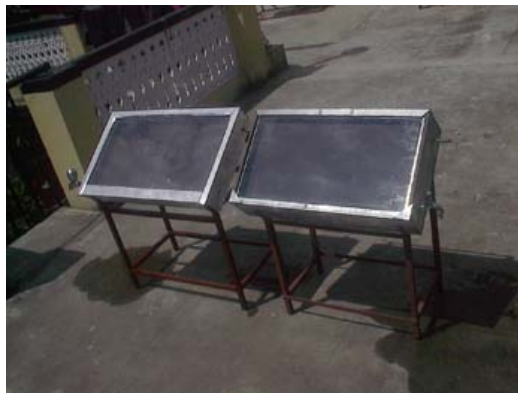
Solar Water Pasteurizer Pasteurizes 14-16 liters water in a day and keeps hot for 10-12 hours after sunset.