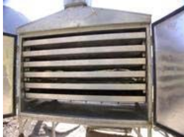
A community solar drier Solar drier drying cabinet with 6 drying trays