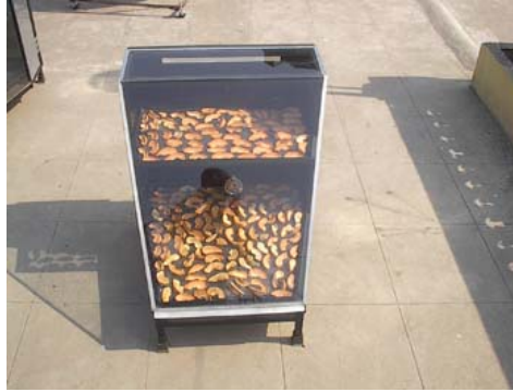
Solar Dryer (four-faced sun-tracking model), Dries 3.5 kgs