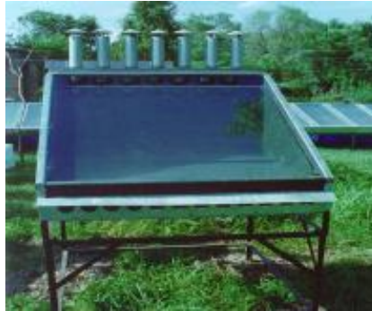
Modified Cabinet Type Solar Dryer at by RECAST