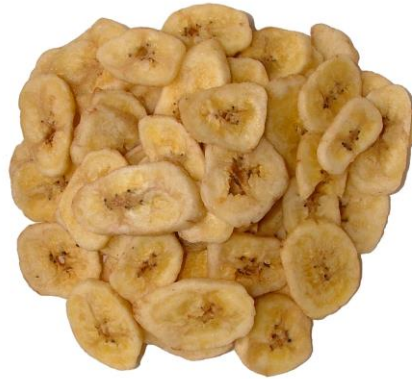
Figure 1: Banana chips.

There are two different methods for making banana chips. One of these is to deep fry thin slices of banana in hot oil, in the same way as potato chips or crisps. The other is to dry slices of banana, either in the sun or using a solar or artificial dryer. The products made by the two methods are quite different. The deep fried chips tend to be a savoury, high calorie product that is eaten as a snack food. Because they are deep fried in oil they have a fairly short shelf life- up to 2 months maximum when stored in the correct conditions. The oil is prone to turning rancid and the crisps to becoming soft if they are not stored in air-tight containers.