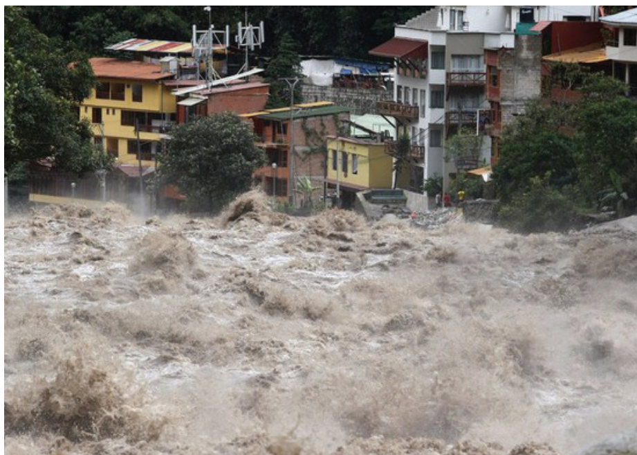
Severe flooding of the Vilcanuta River in Macchu Pichu, Peru.

Floods are the most common cause of weather-related disasters globally, and the incidence of severe flood events has increased significantly in the last three decades (CRED and UNISDR, 2015; PreventionWeb, 2016). Zurich launched the Zurich Flood Resilience Alliance in 2013 to advance knowledge, develop expertise, and design strategies to help communities build their flood resilience.