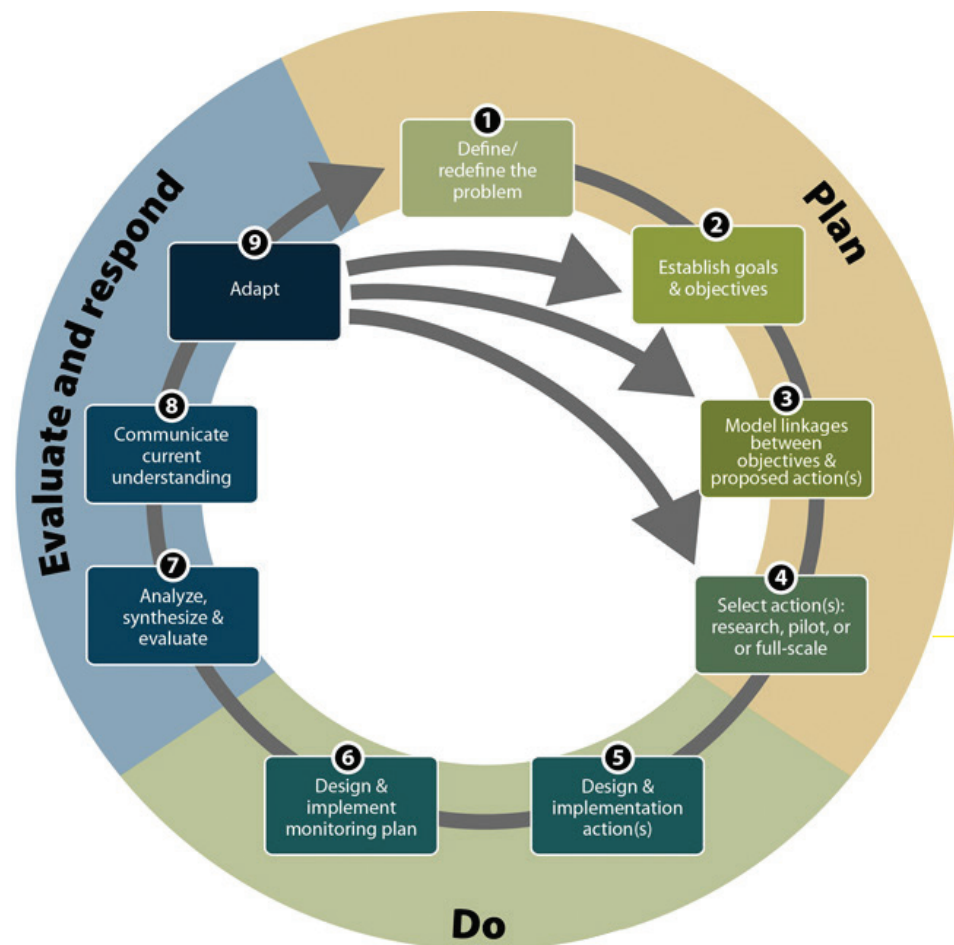
Figure 1 A visualization of adaptive management.

In this figure, learning and adaptation both follow and precede goal setting, planning, and implementation. To manage adaptively is to acknowledge that it is impossible to know exactly how a development intervention will interact with a particular political, social, and environmental context. It requires us to recognize that change in such contexts is inevitable, ‘emergent and contextual’, rather than something that is imposed upon a stationary situation (Valters et al., 2016).