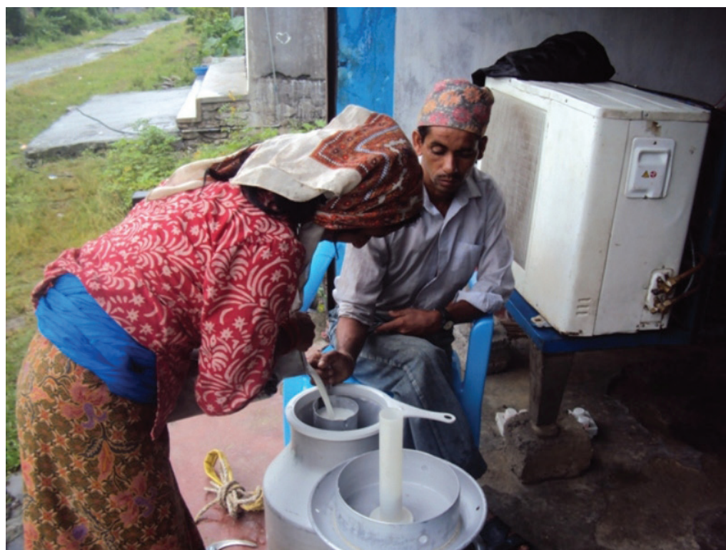
A smallholder farmer sells her milk to a local collection point in Nepal, credit: Practical Action Nepal © Practical Action