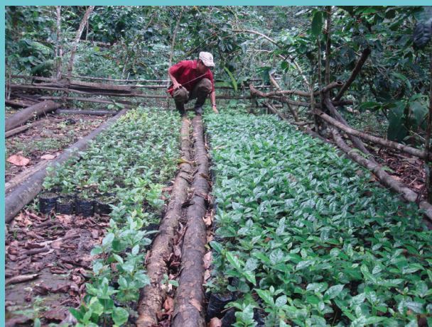
A skilled Peruvian coffee farmer raising coffee seedlings for his shaded and biodiverse farm in the cloud forests of San Martin

The agroecological market system approach is estimated to have the potential to quintuple coffee exports from Peru. About 30 million tonnes of carbon dioxide per year could be captured by decreasing deforestation and water treatment. Practical Action is working with regional governments and national ministries to adapt policies and legislation to enable this production system to be scaled up across the country.