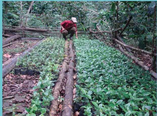
A skilled Peruvian coffee farmer raising coffee seedlings for his shaded and biodiverse farm in the cloud forests of San Martin

The agroecological market system approach is estimated to have the potential to quintuple coffee exports from Peru. About 30 million tonnes of carbon dioxide per year could be captured by decreasing deforestation and water treatment. Practical Action is working with regional governments and national ministries to adapt policies and legislation to enable this production system to be scaled up across the country.