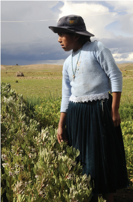
A Bolivian farmer tending to her quinoa crop – a resilient, nutritious and valuable crop for Andean farmers