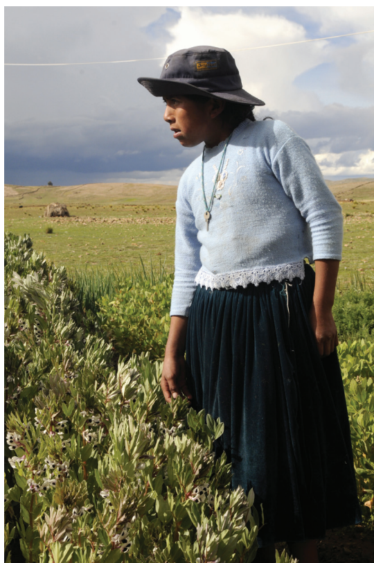
A Bolivian farmer tending to her quinoa crop – a resilient, nutritious and valuable crop for Andean farmers