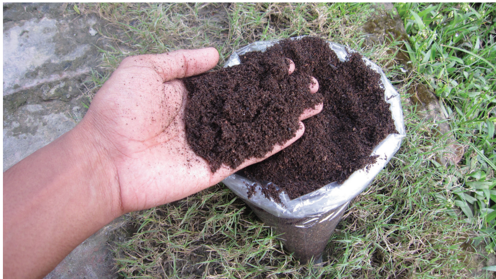
High-quality organic compost produced in Bangladesh from urban waste, credit: Mahobul Islam © Practical Action

Participatory markets are more likely to be innovative and deliver affordable and appropriate technology