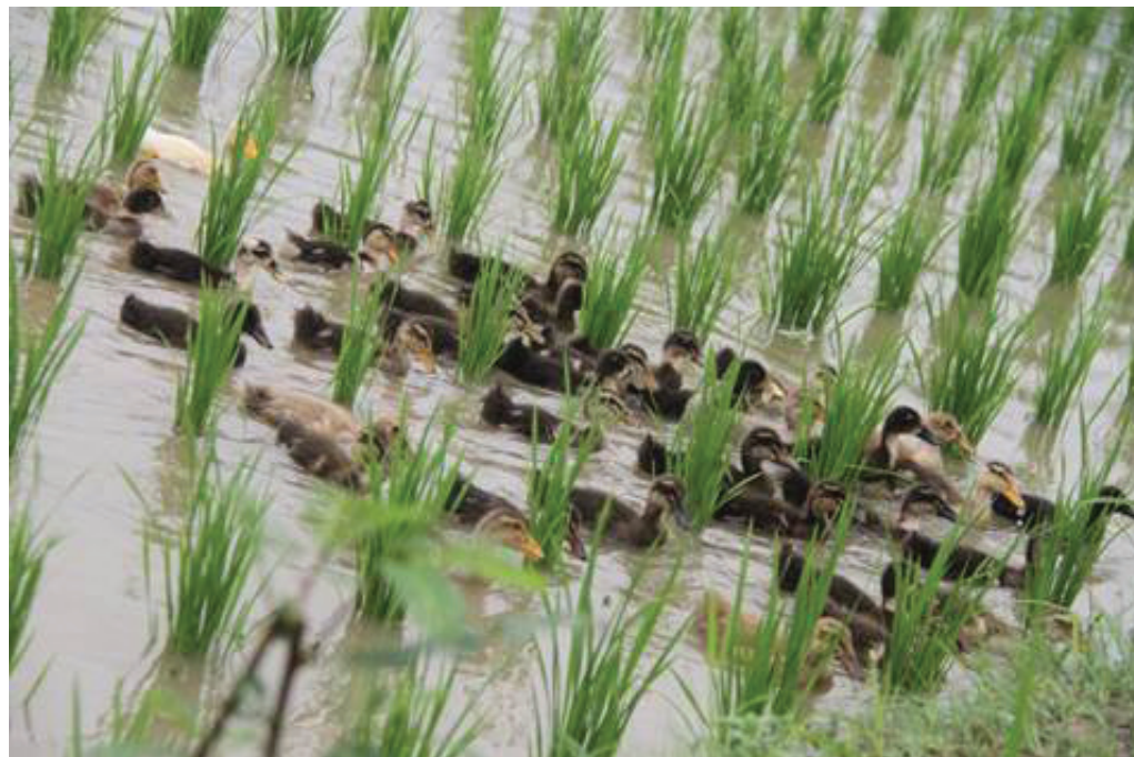
Rice-duck farming provides environmental and productivity benefits and new and diverse market opportunities

It is vitally important to find common ground between private-sector interests and development objectives