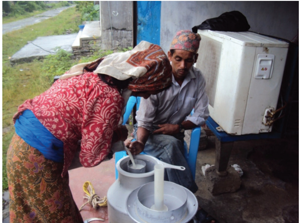
A smallholder farmer sells her milk to a local collection point in Nepal