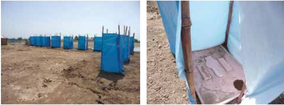
Newly built latrines in a small IDP camp near Jacobabad, Pakistan 2010. There is little privacy, no cleaning organized and as a result they were not used. Thousands of these types of latrines were built in the Sindh and Baluchistan provinces after the flooding disaster.

read a 200-page manual. Additionally, agencies often work with the staff they have or can hire in a short period of time, sometimes without any emergency WatSan experience. The pressure to complete activities in a short time, difficulties in finding qualified staff, and problems with funding or supply issues, can all result in what is frequently seen in emergencies: inadequate facilities set up, constructed without any input from the users, limited planning to clean or maintain the facilities, and inappropriate design for the needs of their users, especially women. Gender issues are regularly overlooked.