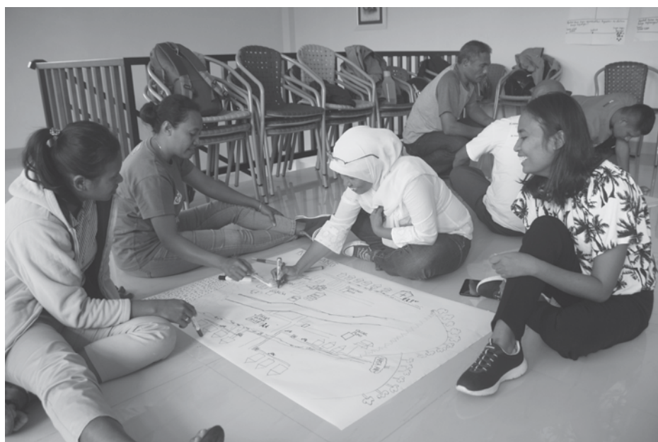
Photo1 Plan International Indonesia team practising a participatory community-based climate resilience activity

Next, ISF-UTS staff presented the CSO participants with a selection of participatory rural appraisal-style activities that were contextualized for learning about inclusive WASH and climate change in communities. These activities included various forms of community mapping, catchment mapping, transect walks, focus group discussions, Water Safety Plan risk assessments, participatory analyses of local resources and social norms, and futures visioning. The participants deliberated on each activity before voting which to pilot. The CSO participants then simulated the selected activities among themselves. For example, the PII team simulated a climate-sensitive sanitation accessibility audit by walking from a nearby neighbourhood to the workshop venue's toilet. This simulation helped to build the confidence of the CSO staff to pilot the activities and facilitate discussions on climate change with community members.