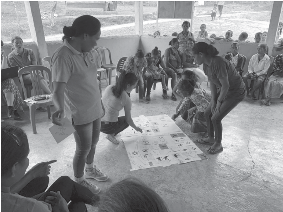
Photo 2 Women's group in Timor-Leste participating in the impact diagram activity

who preferred to describe at home their experience accessing a toilet during climate hazards rather than go on a transect walk (this modification was then recorded as an optional step in the guidance materials). The team also held interviews and focus group discussions relating to climate impacts on WASH separately for women, men, and local government officials to complement the team's learning about issues confronting communities.