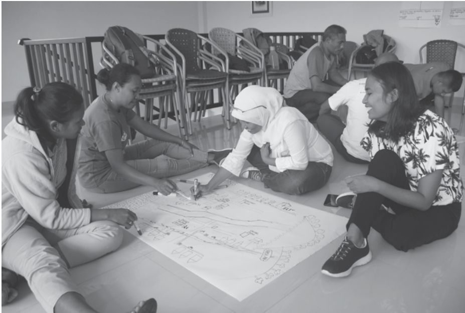
Photo1 Plan International Indonesia team practising a participatory community-based climate resilience activity

Next, ISF-UTS staff presented the CSO participants with a selection of participatory rural appraisal-style activities that were contextualized for learning about inclusive WASH and climate change in communities. These activities included various forms of community mapping, catchment mapping, transect walks, focus group discussions, Water Safety Plan risk assessments, participatory analyses of local resources and social norms, and futures visioning. The participants deliberated on each activity before voting which to pilot. The CSO participants then simulated the selected activities among themselves. For example, the PII team simulated a climate-sensitive sanitation accessibility audit by walking from a nearby neighbourhood to the workshop venue's toilet. This simulation helped to build the confidence of the CSO staff to pilot the activities and facilitate discussions on climate change with community members.