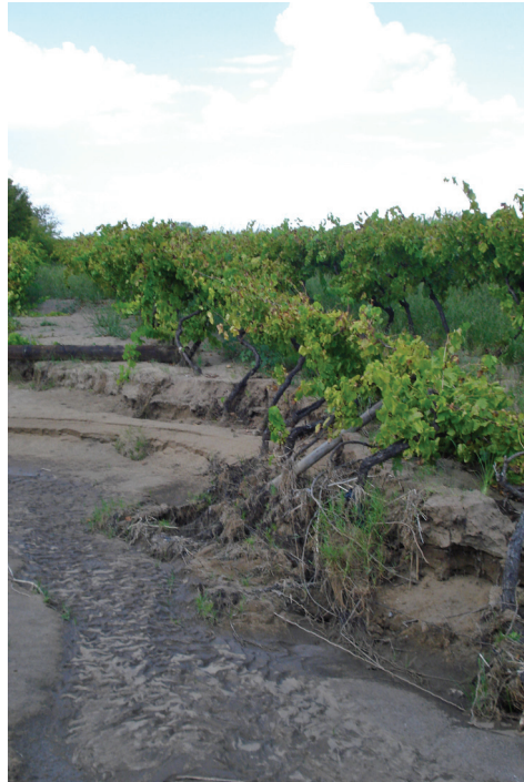
Figure 2 Flood damage

Traidcraft is faced with the paradox of attempting to support sustainable livelihoods in an area considered non-viable for agriculture because of environmental risk and in which these risks are becoming more frequent. Total rainfall and frequency of extreme weather events are predicted to increase over the Orange River basin