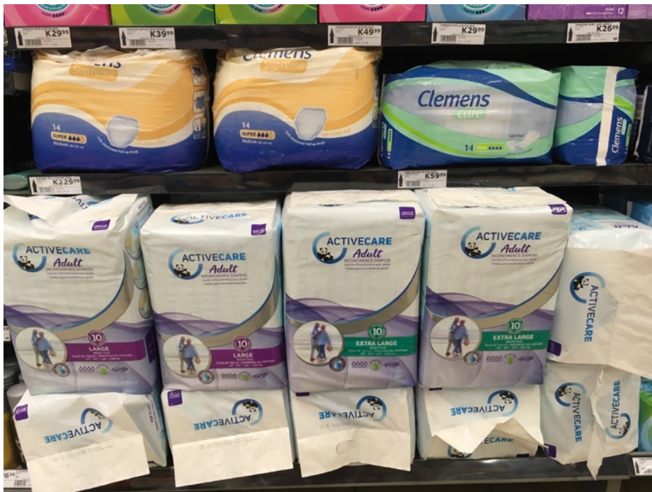
Figure 3 Incontinence products from a Pick'n'Pay supermarket, Lusaka, Zambia

For those who cannot afford disposable products, management is often dependent on the use of reusable cloths (in a manner similar to the management of the menstrual cycle). Maintaining a sufficient level of hygiene and an acceptable level of smell when using cloths can be a challenge. This was not found to be due to the unavailability of water, even though in 2015 only 61.2% of the Zambian population had access to an improved source of drinking water within 30 minutes, and only 44.4% had access in rural areas (WHO/UNICEF JMP, 2017). Instead, the challenge